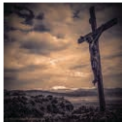
Stations of the Cross, San Luis Colorado