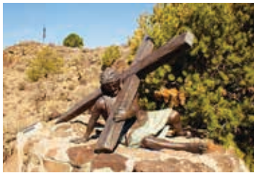
Stations of the Cross, San Luis Colorado

With foot Washing and Stripping the Altar.