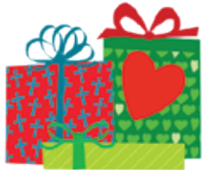
Gifts from the Heart Christmas Shop

Also, heartfelt thanks to all who participate in the Gifts from the Heart Program .