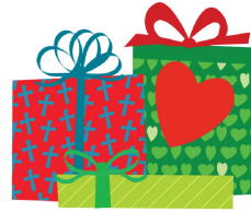
Gifts from the Heart Christmas Shop

St. John's will be participating in the Gifts From The Heart Christmas gift drive again this year. We will be sponsoring a "Giving Tree" with ornaments suggesting a particular gift. Almost 3,000 new toys are needed before that time for the over 900 children served by the ten partnering organizations. We will do our part, in conjunction with other local churches and organizations, to give these families a "hand up, instead of a hand out".