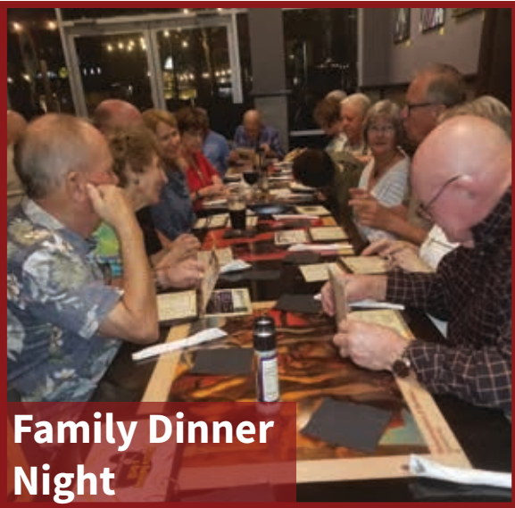
Family Dinner Night