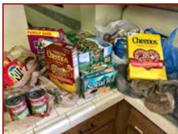
Supporting our food pantry collections

The stitchers also create and donate items to many local organizations. Outfits for both boys and girls are delivered to the Brevard elementary schools for in-need children. Each outfit includes underwear, socks and shoes.